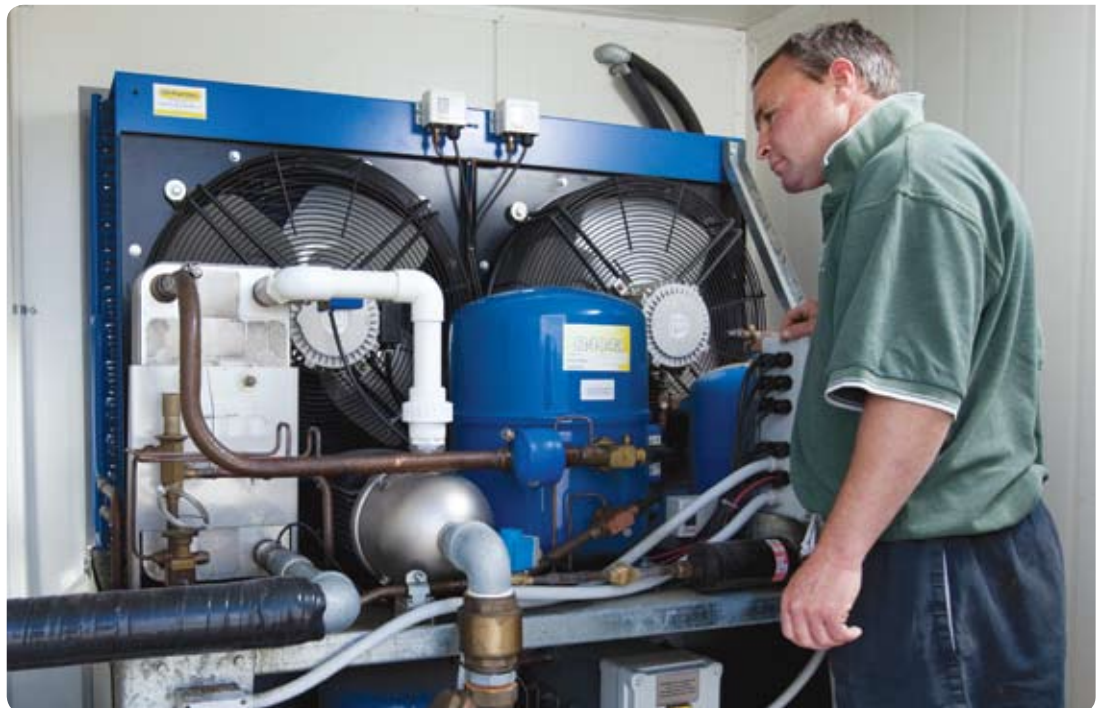
Insulating pipes will prevent energy loss.

MEDIUM TO HIGH. Polar wrap $2,017 (7,800 litre vat). Thermo Wrap $569 for the kit or $1,044 fitted.