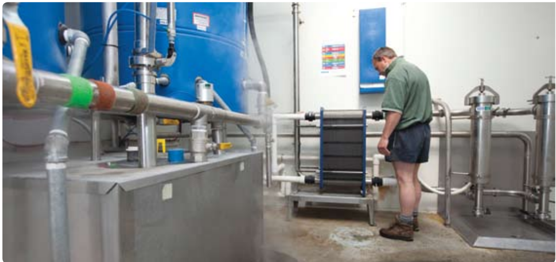
Refrigeration is a major energy user on the dairy farm.